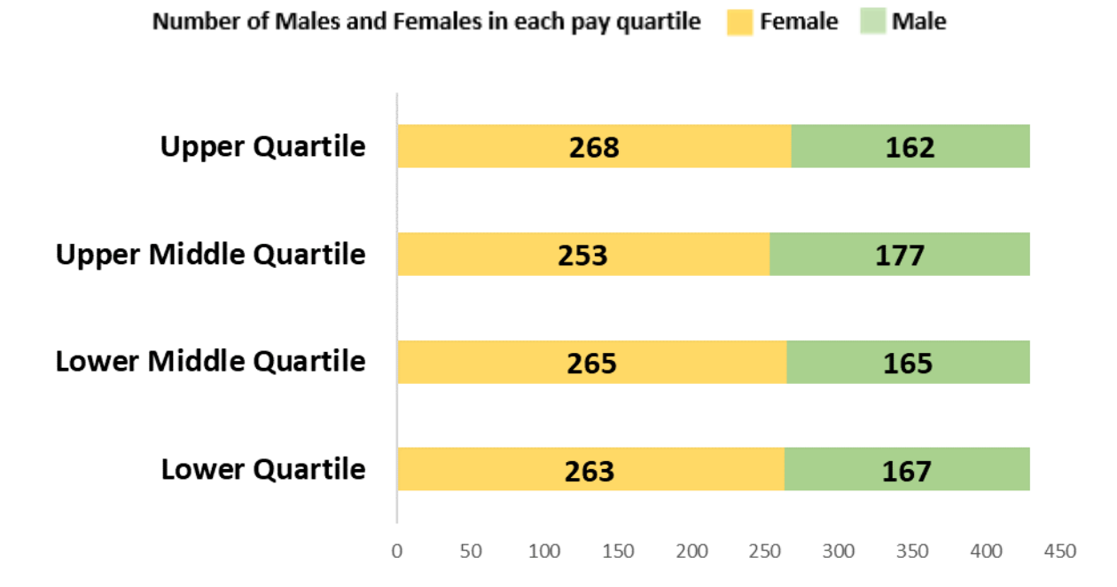
Figure 2 - Number of men and women in each pay quartile